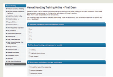
Test and Certification.

“More than a third of all over-three-day injuries reported each year are caused by manual handling - the transporting or supporting of loads by hand or by bodily force. Effective training has an important part to play in reducing the risk of manual handling injury.”