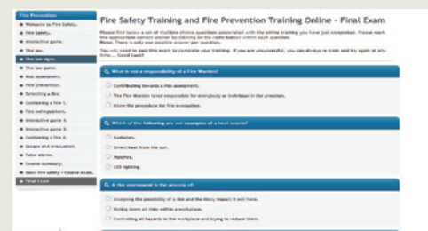
Test and Certification.

“The Regulatory Reform (Fire Safety) Order 2005 applies to all non-domestic premises in England and Wales. The law applies to you if you are responsible for business premises, an employer or selfemployed with business premises, a charity or voluntary organisation or a contractor with a degree of control over any premises.”